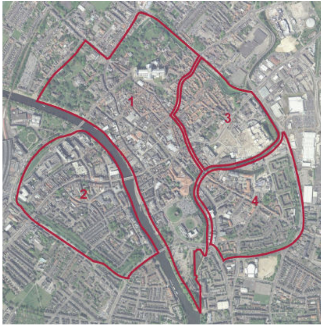
Strategy – four functional areas of the City Centre.

22. The strategy of creating Traffic Cells for the four functional areas and Priority Routes allows for necessary access to the city centre but discourages through traffic. This would reduce the overall